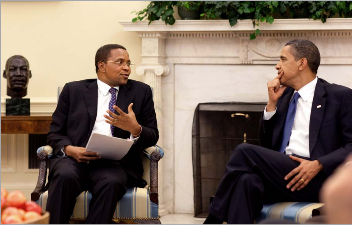
President Barack Obama meets with Tanzania President Jakaya Kikwete in the Oval Office May 21, 2009. This was the President's first meeting with any African Head of State. A bust of Martin Luther King is at far left.