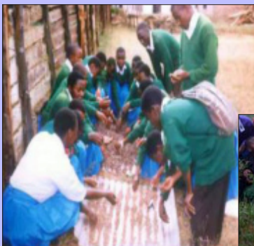
School children learning how to plant and care for seedlings