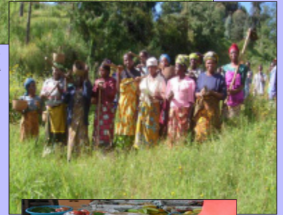
Villagers planting trees during a previous phase of the NJOWECA Tree Farm