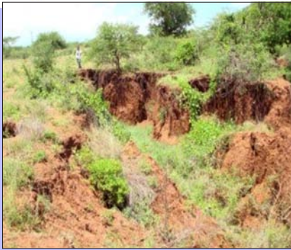
Before NJOWECA reforestation